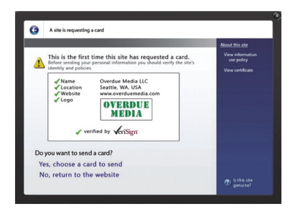
FIGURE 2: An example of a higher-value certificate [5].

In general, it would appear that a typical user is not qualified to make such a security critical decision. Most users do not pay much attention when they are asked to approve a digital certificate, either because they do not understand the importance of the approval decision or because they know that they must approve the certificate in order to get access to a particular website. RPs without any certificates at all can be used in the CardSpace framework (given user consent), and this leads to a serious risk of a privacy violation. If we consider the potentially massive number of RPs, it is likely that (at least initially) many of them will not possess a high assurance certificate. Even in the case where an RP does have a high assurance certificate and the user is careful, the user may be deceived by a company name or logo that is similar to that used by a legitimate RP (although in principle this should be prevented by the registration process for a high assurance certificate).